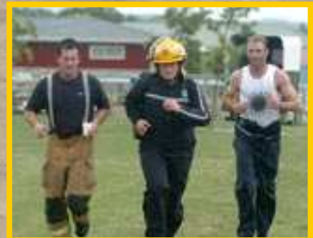
Packing heat